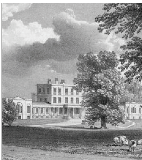
Pylewell House circa 1830

6.00 pm—8.00 pm. Tuesday the 7 th of February 2012.