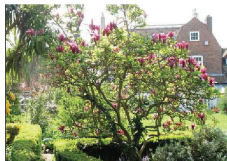
Chawton House Garden

Garden of Chawton House Surgery St Thomas Street